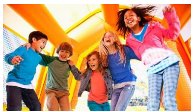
FVIS Bounce-a-thon 2023

We are looking forward to hosting the FVIS sponsored bounce-a-thon on Monday 20th February so please ask friends and family to sponsor your child to bounce as many times as they can in 2 minutes on the castle at school.